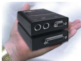
Small in size, loaded with features

The Serial/Audio model allows stereo audio to be transmitted in either direction across the CAT5 link simultaneously. Many serial devices like a Touchscreen can plug directly into the serial port on the Remote Unit. The Mini model is small in size but loaded with state of the art technology. It is ideal for extending the distance between a CPU and a KVM station (up to 150 feet).