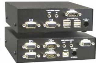
Dual Video w/serial-audio

■ Phone: 281-933-7673 ■ E-mail: sales@rose.com ■