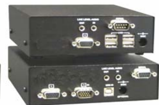
Single Video w/serial-audio