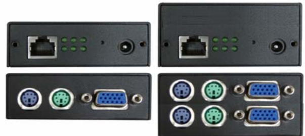
Front / Rear View

■ Phone: 281-933-7673 ■ E-mail: sales@rose.com ■