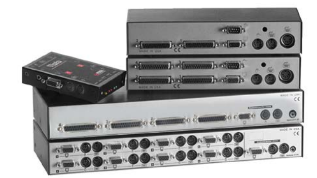
Rear view of Vista models KVL-8PCA, KVL4UA, KVT-2PC, KVM-4UPH, KVM-2UPH

■ Phone: 281-933-7673 ■ E-mail: sales@rose.com ■